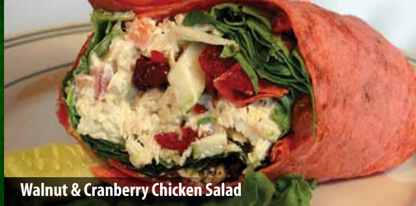
Walnut & Cranberry Chicken Salad

Served in a Sun-Dried Tomato Tortilla with your choice of: Fresh-Cut Fries, Potato Salad, or Coleslaw. Substitute Sweet Potato Fries - $1.29 or Onion Rings - $1.79 Add a Garden or Caesar Salad - $1.99