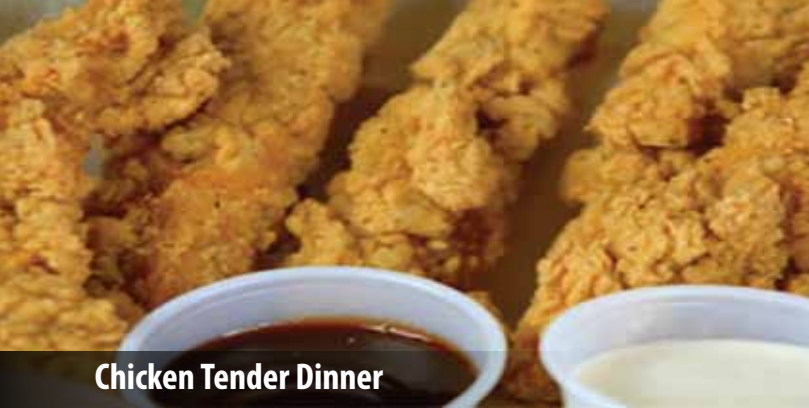
Chicken Tender Dinner