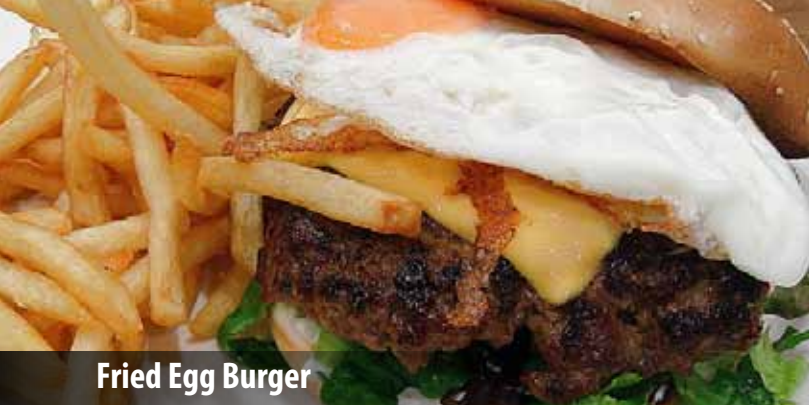
Fried Egg Burger