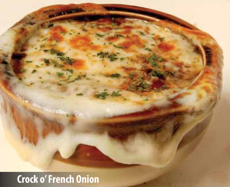
Crock o' French Onion